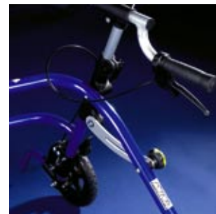
Driving brake and wheel lock