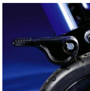
Reverse-roll lock at the rear wheels (can be activated and deactivated)