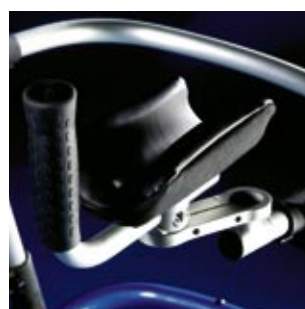
Grip bar with forearm supports and vertical hand grips