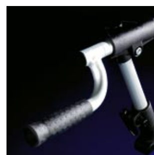
Grip bar with universal grips for grip width reduction