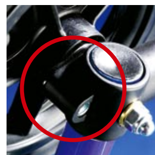
Friction brake at the rear wheels