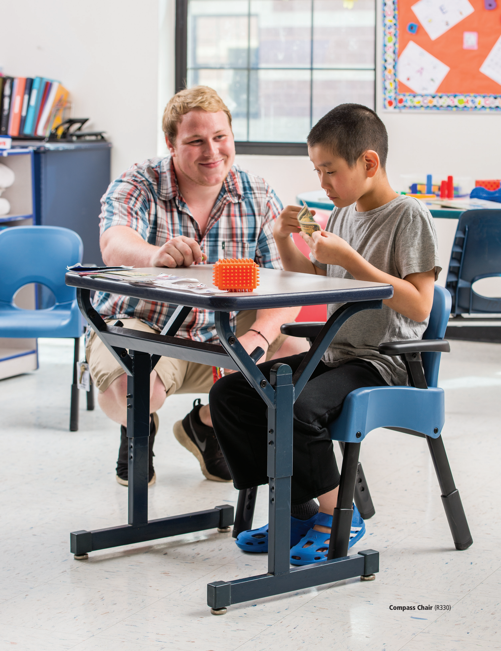
Compass Chair (R330)