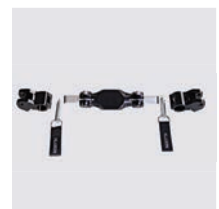
Central Linking System Klaxon®