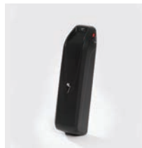
Race Battery (48V x 11Ah) Fly-Version (48V x 5.8Ah)