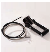
Handlebar Extension Std Handlebar Extension Tetra