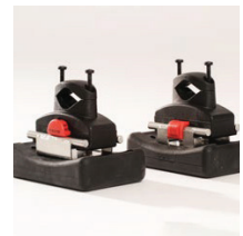
Additional Traction Weight