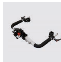
Lateral Linking System Klaxon®