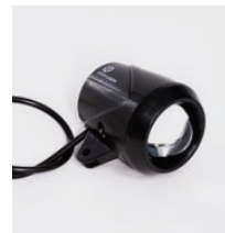
Front Light Monster/Race