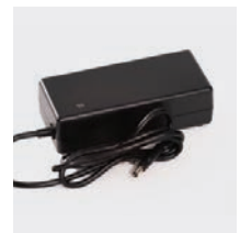
Slim Battery Charger Mini Battery Charger