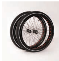
X-Large Wheels Set