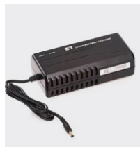
Race Battery Charger