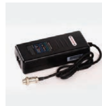
Power Battery Charger Hybrid Battery Charger