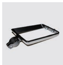
Basket Linking Kit