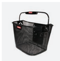
Basket 10L and 16L